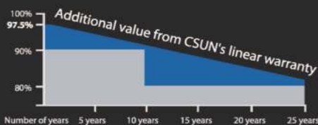
CSUN's NEW linear performance warranty